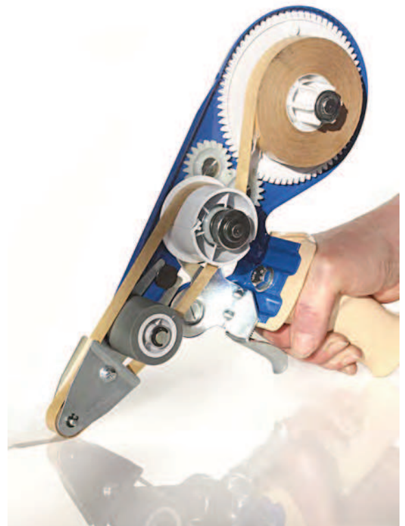
DSH/25 TR + short 12mm extension arm