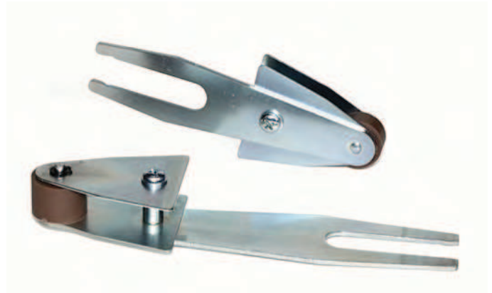
Long and short arms for DSH/25 TR

The extension brackets are produced in 2 versions: long (L= 105mm) and short brackets (L=65mm).